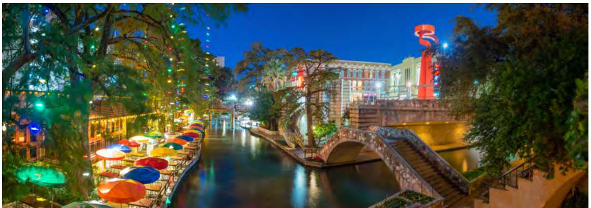
River Walk San Antonio, Texas at Night (Adobe Stock Image)