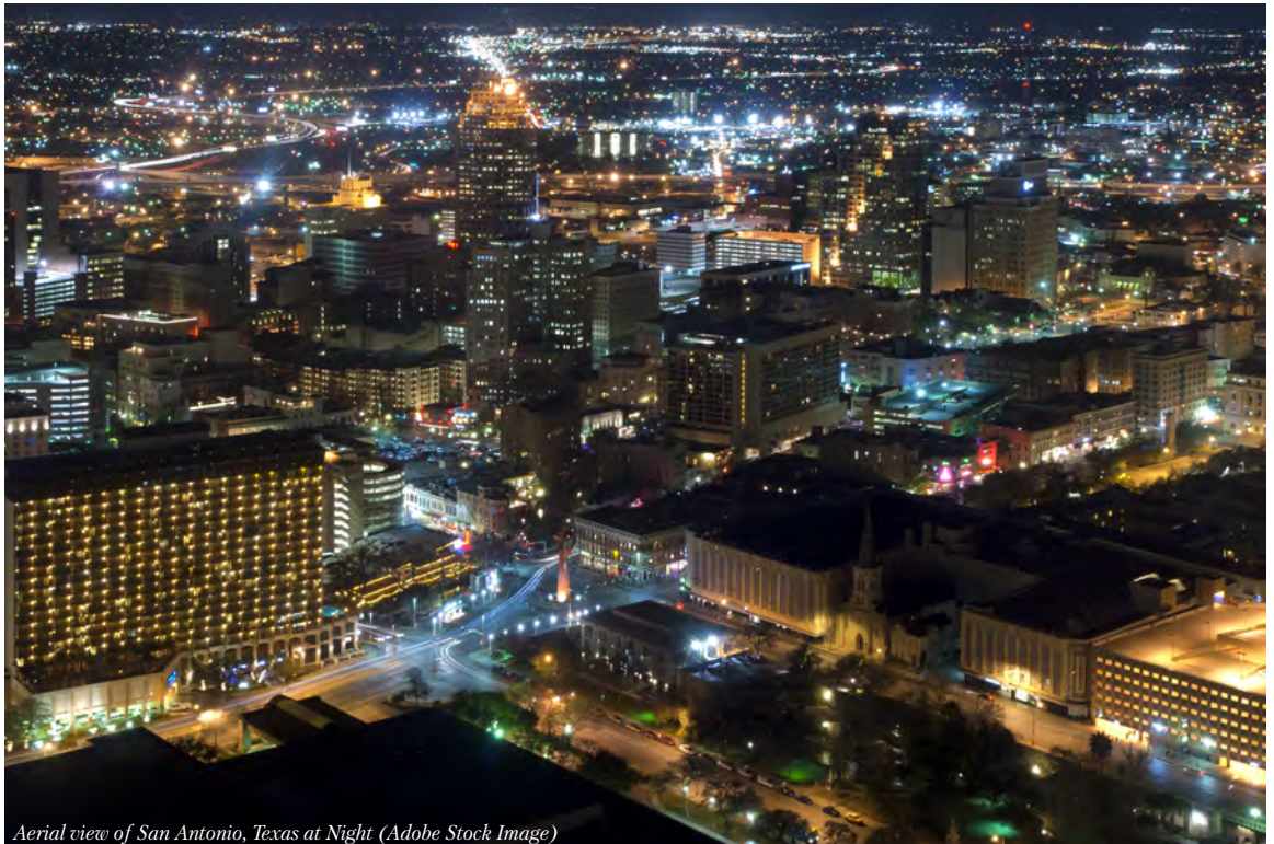
Aerial view of San Antonio, Texas at Night