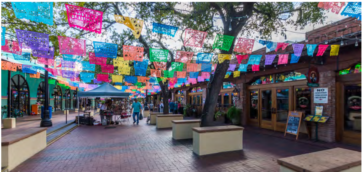
Historic MarketSquare Mexican Shopping Center, San Antonio, Texas